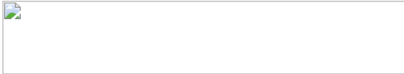
(DCSP4 - four unit power supply)

Simply route any CobraNet line on the network to a Whirlwind DCSP power supply located at any convenient location within 100 meters of the DCS88. Connect the output of the supply to the DCS88. That's it! Power supplies are available to power one or as many as four DCS88s.